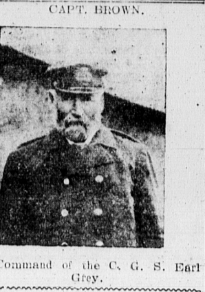
In Command of the C. G. S. Earl Grey.

A Well-known Man. Minard's Liniment Co., Limited, Dear Sirs:—I can recommend your MINARD'S LINIMENT for Rheumatism and Sprains, as I have used it for both with excellent results.