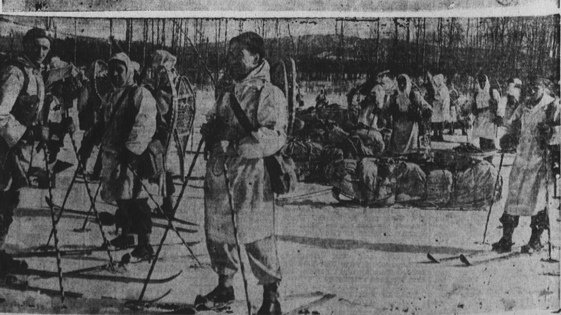
Peaceful, snow-covered meadows, apparently devoted of life to the observer a few hundred yards away, suddenly disgorged lines of charging men as ski troops practice winter manoeuvres in many parts of the Canadian countryside. Spread across the field, these white-clad soldiers (TOP) learn to crawl silently toward an unsuspecting foe. Days and nights in the snow harden these winter warriors (BOTTOM) for any type of service and teach them to look after themselves in all conditions. Equipment loaded on toboggans, skis strapped on their feet, they are ready to start on a three-day trek. Each man carries complete army equipment, including respirator.