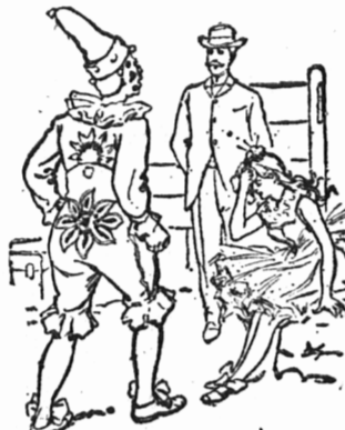
"DON'T, JIM!" SHE SAID PLAINTIVELY.

He turned on her sharply. "See here, Nell," he commanded. "Don't talk like that. It's hard work doing two acts twice a day. It's not for you, my girl. Make up your mind to that."