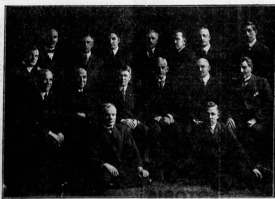
BOARD OF DIRECTORS, CHARLOTTETOWN, Y. M. C. A.