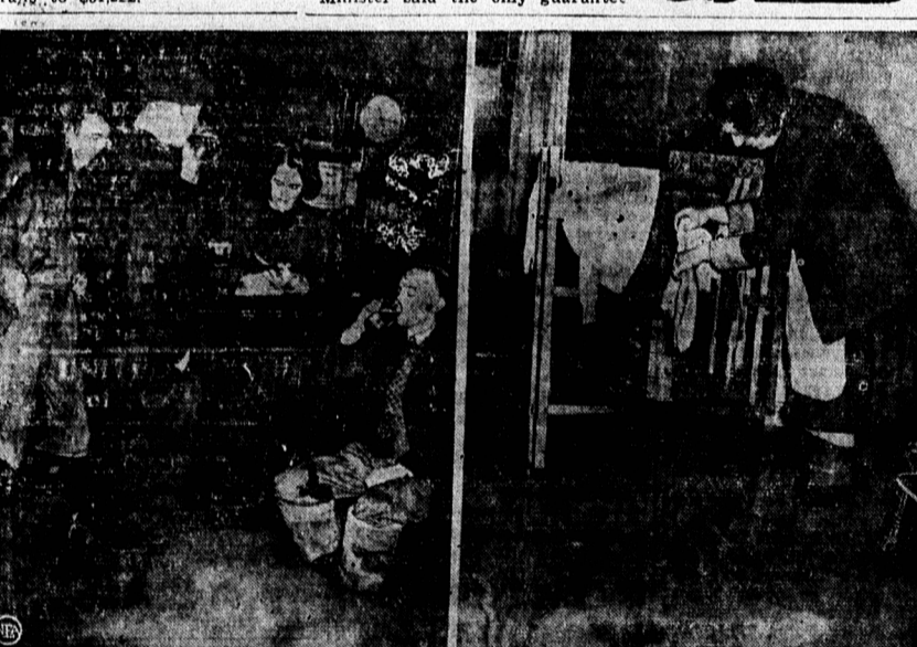
First it was snow storms, now floods that are crippling England. From London where the swollen Thames River has contaminated the municipal water supply an emergency call has gone out for tank-truck loads of drinking water. At Maidstone, in Kent, the River Medway rose to its highest level in 27 years, flooding its banks and then the town. The customers at an inn (left) wade through water to get a drink at the bar and a housewife (right) wears boots to do her housework. To complicate matters, another round of hizzards and gales hit the country over the week-end.

BRANDON, Man., April 2 — (CP) — Agriculture Minister J. G. Gardiner said here last night that the subsidies paid by the Federal Government on barley and oats used for feeding purposes will be discontinued next Aug. 1. The present subsidy on barley is 26 cents a bushel and on oats 10 cents. Speaking at a banquet tendered the Manitoba winners in the national barley contest, the Federal Minister said the only guarantee