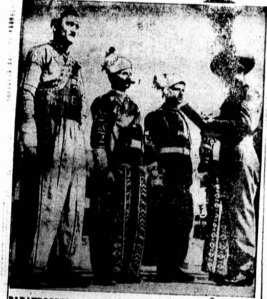
PARATROOPERS CHECKING OUT —These gentlemen in fancy dress are Iraq Levies who don native garb when leaving RAF paratroop training station on pass. Known for fighting skill, scores have made more than 3000 jumps.