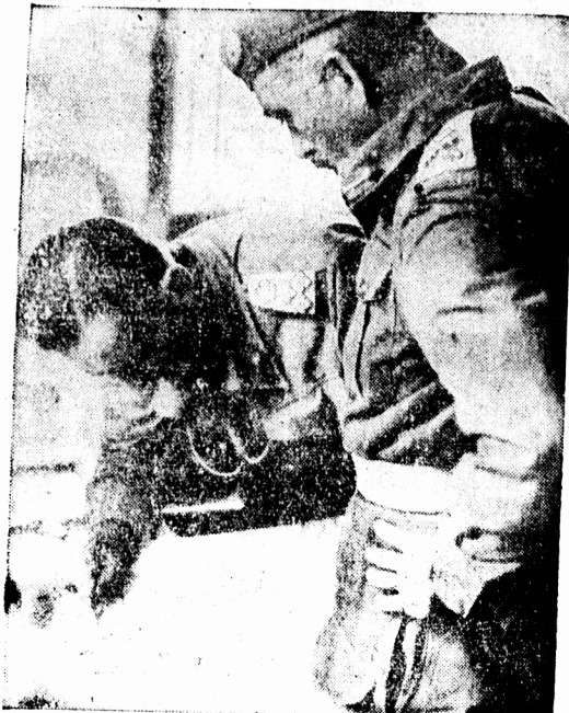
In this farm house in full view of the enemy Major-General Chris... make plans to drive out Nazis who have pinned down Canadians by heavy mortar and artillery fire. The action was about a mile west of the town of Biscione.

14,000 PARTS BATTLE HAZE There are about 14,000 individual parts in a light war tank. Spartans in 400 B. C. used wood smoke as a form of gas warfare.