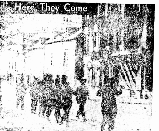
What's happening to a good part of the German army under the Allies' fierce drives is graphically portrayed in the photos above. At top, two Allied fighters dash up the street in Brest, France, toward a house where Germans are holding out. Lower photo shows them coming back, herding their Heinkes before them.