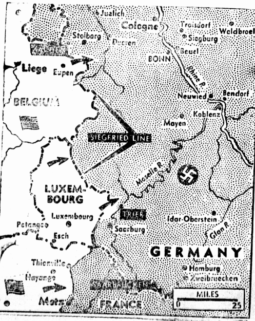
Arrows point to where double invasions of the Allies into Germany carried them within 37 miles of the Rhine. Two spearheads of American 1st Army have penetrated Germany south of Aachen and beyond Trier, while the 3rd Army has launched extremely heavy attacks on sides of Metz. Meanwhile an armada of 5,000 planes converged on the land from the west and south, ripping other invasion paths into the Reich.