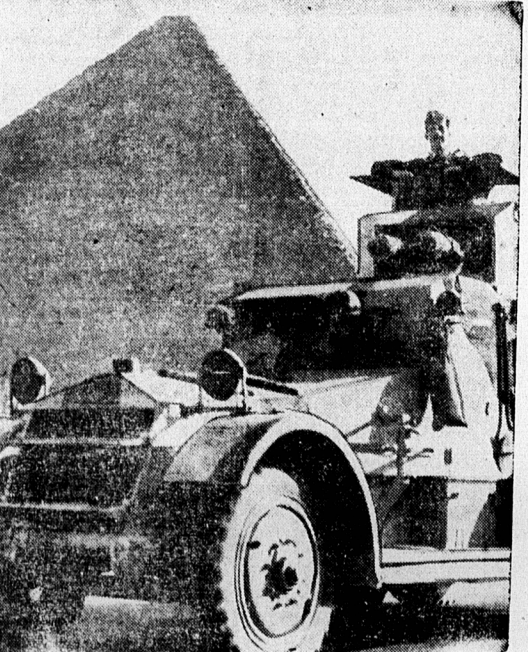
British forces in Egypt have shown hard-hitting initiative. They have penetrated 30 miles into Italian Libya and have taken several hundred prisoners, including a general and his wife, and two forts. The British operations are noteworthy when it is considered that they have to transport water over hundreds of miles of desert. Italian land forces have generally been taken by surprise and have shown little inclination to resist.

Advertising Rates Payable in Advance Minimum Charge for Any Advertisements 25 Cents Central Guardian locals, 5c per word; Western and Eastern locals 2c per word; Announcements and Coming Events 3c per word; Classified 3c per word; In Memoriam Notices 70c per inch; Lists of Firms and Spiritual Offerings, Cards, etc., 5c per name; Letters of Condolence 70c per inch. Wedding engagements 40 words for $1.00 and 19 cents for every additional 3 words. Notices of Thanks and Appreciation 70c per inch or 4c per word. Lists of Subscriptions per inch. Address and Presentation $1.00. Other rates on application.