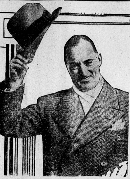
DAYTONA BEACH, Fla., Feb. 14.—(A.P.)—Sir Malcolm Campbell of England here seeking to break his own world land speed record of 253 miles an hour flashed over the ocean beach at a speed of 212.63 miles an hour on a 2 kilometre route here late today on the first of a series of test runs in his Bluebird racing car.