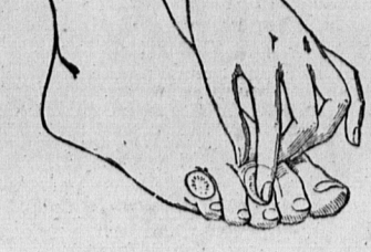
This is the size and shape for corns or tender spots caused by shoe pressure and friction.