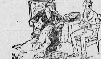
I simply had to help father with his business, he was so worried—"