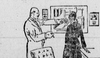
and I thought it best to make an investment at once. Well that failed—"