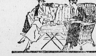
"You see I had only a few thousand dollars left after the estate was settled—"