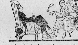
and my brother borrowed some to help him along; of course that went and then—"