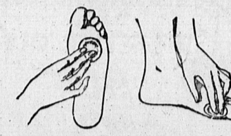
This is the size and shape for calluses, tender spots or blisters.