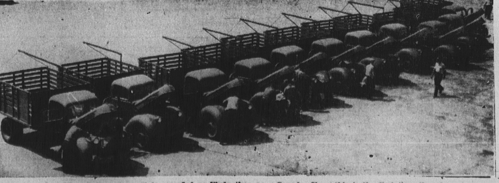
Two thousand mechanized units are required for each division, apart from trucks and motorcycles, and it is believed that nearly all the transport equipment in Egypt was sent from the two large motor manufacturing concerns in Canada.