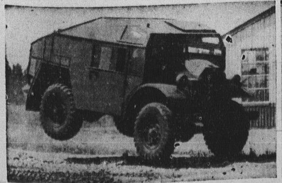
Across the burning sands of Egypt, Canadian-made army trucks are smash against Mussolini's legions. It is regarded as likely they assisted in the capture of Sidi Barrani, which Prime Minister Churchill described as "a victory of the first order." Shown here are some of the vehicles made by General Motors and the Ford Motor Co. of Canada.