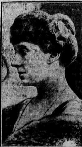
KING'S COUSIN ILL Recent portrait of Princess Marie Louise, first cousin of the King, who is seriously ill in London.

General view of a cane sugar plant in India. At RIGHT, note the bullock with a fresh load of sugar cane, behind it the machine which presses the juice from the stalks and in the foreground a boiling cauldron, heated by the dried and pressed cane stalks.