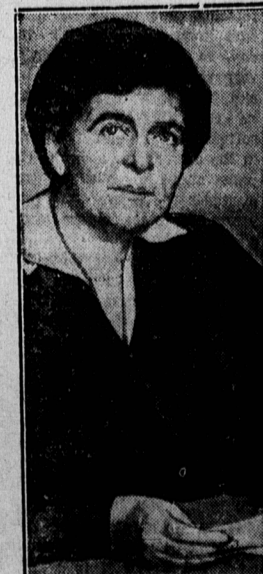
REMOVED FROM BENCH