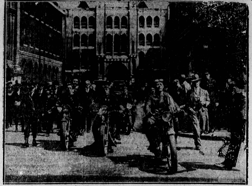
JEWISH PARTY VISITS LONDON, ENGLAND A party of Jewish motorcyclists are motorcycling through Europe to call attention to the forthcoming Jewish Olympic games. They are seen here leaving the Guildhall, London, England, after a visit with the Lord Mayor of London.