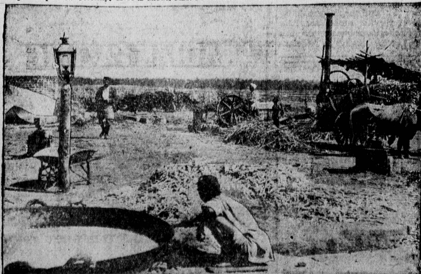
ONE OF COUNTRY'S LEADING INDUSTRIES

Scores of homes and buildings were damaged, traffic jammed, trolley, light and phone service were disrupted when a 55-mile-an-hour gale hit Cleveland, O., June 26. Photo shows wreckage of, sign-boards which were blown over during the storm on Cleveland's west side.