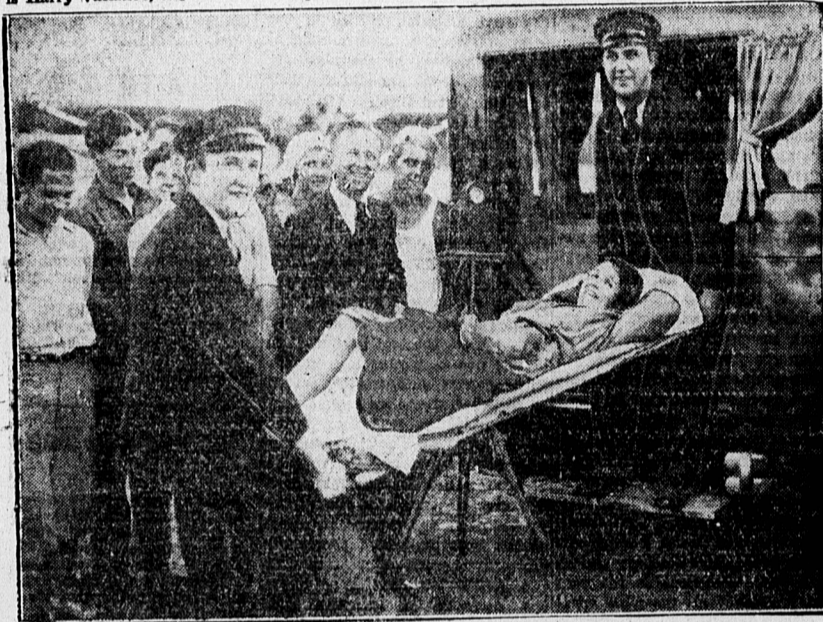
RUTH TO REST BEFORE MAKING ANOTHER ATLANTIC ATTEMPT In a plane piloted by Clarence Chamberlain, her adviser, Ruth Nichols, who was badly hurt at St. John, New Brunswick, on the first leg of her projected transatlantic flight, arrives from St. John at Armonk, New York, airport. She was immediately whisked away by ambulance to her home at Rye, where she will rest a bit before making another flight attempt.