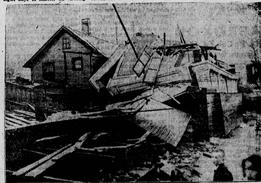
MANY BUILDINGS DESTROYED BY OHIO STORM