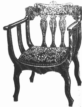
$6.95 to $18.00.