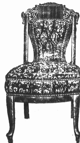
$4.50 to $15.00.