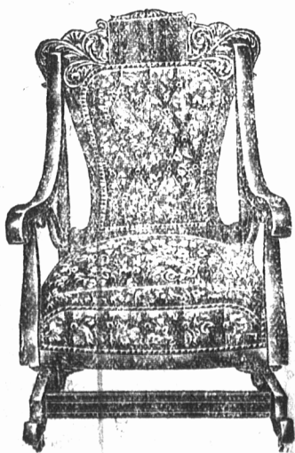
Part of $40.00.