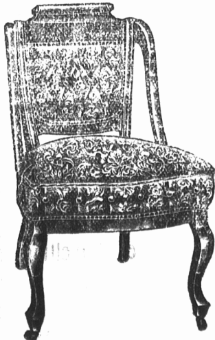
Part of $40.00.