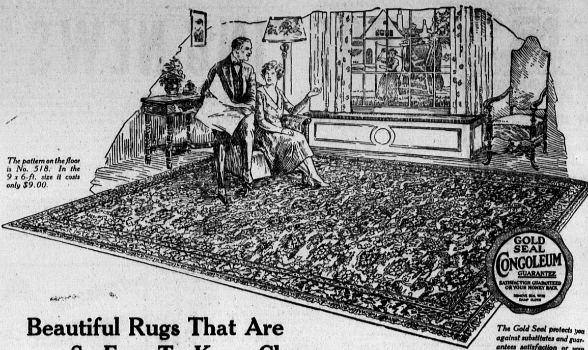
The pattern on the floor is No. 518. In the 9 x 6-ft. size it costs only $9.00.

Every bean tender but never mushy—Nutritious and delicious. Your choice of Sauces: Tomato—Chili or Plain. "Canada Approved" on every tin. Sold everywhere. 12-24