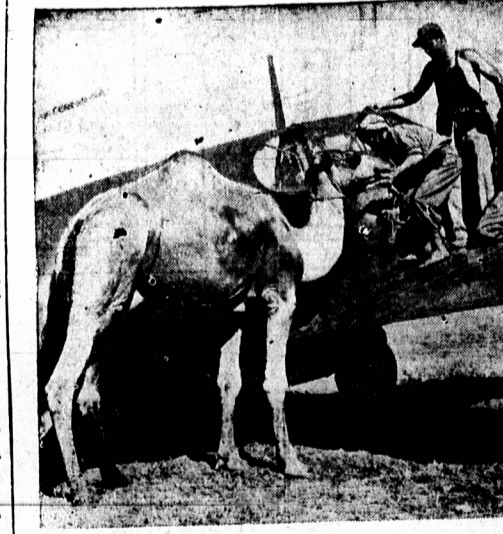
While his Arab master eagerly peers inside one of the new A-36 fighter bombers, a camel displays professional jealousy in his lack of interest in the strange winged creature at an advanced North African base. The A-36 planes—converted North American P-51 Mustang fight-ers—are regular action stars.