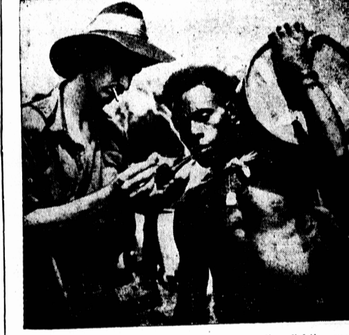
Pipe-smoking native gets a light from Australian fighting man, before setting out to carry supplies to Allied soldiers in a forward area of New Guinea's Wau-Mubo sector.