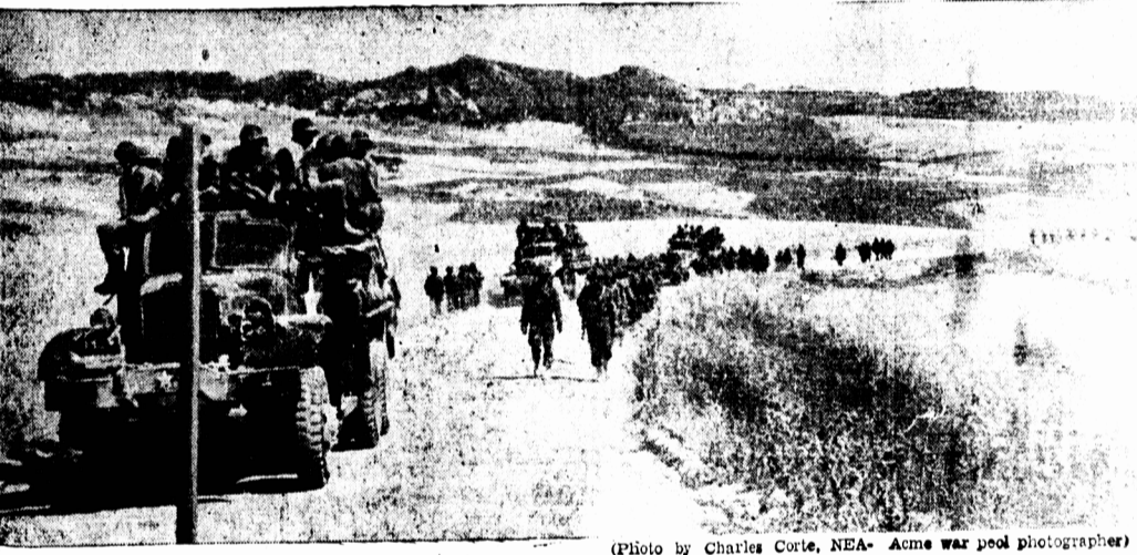
Long lines of men march in Sicily these days—the victors headed north and east into the final battles, the vanquished headed southward away from war. Re-miniscent of the djebels of Tunisia is the hilly scenery, above, where an American infantry column of trucks and troops moves along a road toward Palermo. Faces of the Ital-ians who got caught do not display dismay at their captive state, right. Expressions indicate they are glad the war is over for them and look with anticipation to internment in some Allied country. On the first leg of the journey away from Sicily line of outward bound Italian pris-oners marches along a beach, bot-tom left, to board landing craft that will take them to North Africa. These same boats brought invading armies to the island. Once in North Africa, the Italians are led by a Bren gun carrier, bottom right, to a temporary prison camp. From there they may be sent to America or elsewhere while Allied armies continue their northward march into Europe.