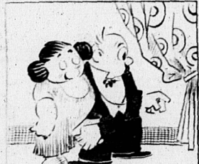
SHOULD CERTAINLY SHINE. "She's ambitious to have her husband shine in society?" "Well, doesn't he? He's always in it."