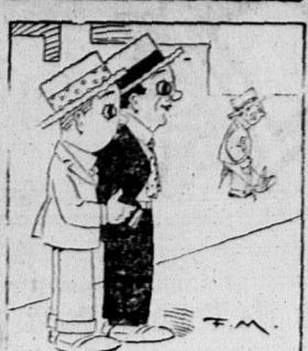
BRAKES NOT FIGHT. How did he have such an awful accident? Weren't his brakes tight? No—he was.