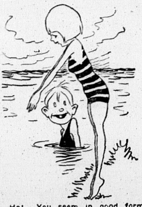
He: You seem in good form today. She: It's bad form to speak of my form.