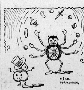
ENNVY. Envious Bug: Oh, shucks, why haven't I got a lot of arms so I can be a great juggler like Mr. Spider.