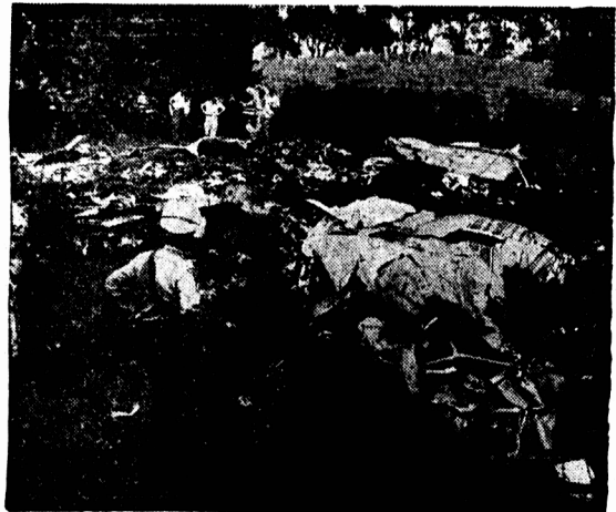
Above is a general view of the wreckage of the Eastern Air Lines passenger plane that collided with a Navy "Hellcat" fighter and crashed on farm two miles from Fort Dix, N. J. The Memphis-bound airliner carried 12 passengers and three crew members and the navy fighter carried one man, all of whom died in crash. So far there is no immediate explanation for the tragedy.