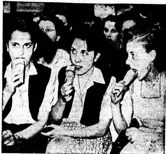
In a move that will make it extremely difficult for many Paris designers to have their fall openings as scheduled, 12,000 seamstresses walked out on strike, just five days before many scheduled openings. The girls are shown at a meeting, keeping cool with the help of ice cream cones. Their wage demand is a four-cent-an-hour increase over the present average hourly wage of 15 cents.