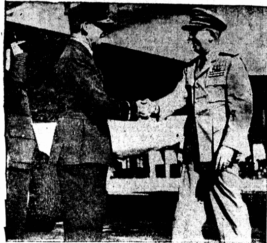
Admiral Louis E. Denfield, chief of United States naval operations, and spokesman for the three United States chiefs of staff who are visiting Europe to discuss the North Atlantic pact military organization, is pictured as he was greeted at Northolt airport, England, by marshal of the Royal Air Force, Lord Tedder, chief of the air staff (left). After the London conferences, Admiral Denfield told newsmen: "All we sought here was an exchange of views and that's what we got. We reached a complete understanding in such an exchange."