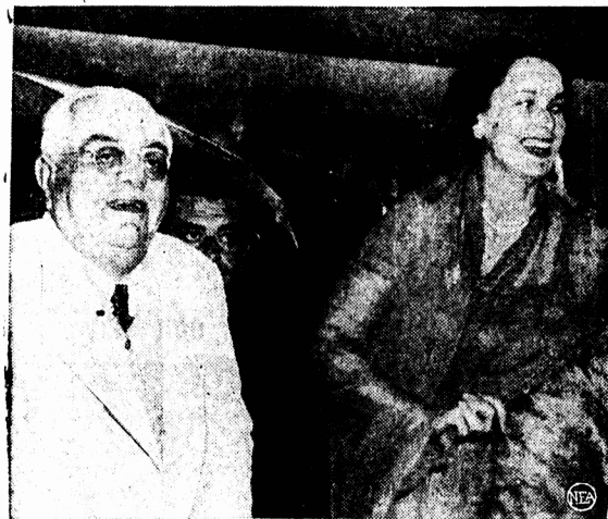
HIGHWAYMEN ON RIVIERA—The Aga Khan, father-in-law of Rita Hayworth and one of the world's richest men, and his wife, the Begum Khan, were robbed by highwaymen near their villa on the French Riviera. Four masked men ambushed their car, shot out the tires and escaped with a jewel case containing gems valued up to $800,000. They also took $6500 in cash.