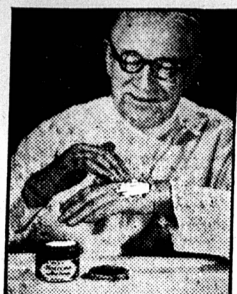
Scores of doctors use Noxzema themselves

"In my practice my hands get in very bad shape," writes a well-known Philadelphia doctor. "I have used all kinds of creams, but Noxzema certainly gives better and quicker results than any other."