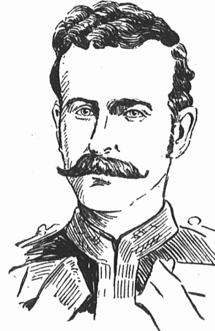
LORD DUNDONALD. Commander-in-chief of the Canadian Militia.

Although not always aware of it, yet thousands die by slow degrees of Catarrh. It first attacks the nose or throat, then the lungs, and finally spreads a little through the system. Catarrh is the only remedy that will immediately prevent the spread of this awful disease. Every breath from the inhaler kills thousands of germs, cleans the throat and nose, aids expectoration and relieves the pain across the eyes. Catarrh eradicates every vestige of catarrh from the system, and is highly recommended also for Bronchitis, Asthma, Deafness and Lung Trouble. Price $1.00; trial size 25c., all druggists. Polson & Co., Kingston, Ont.