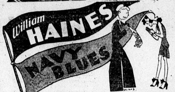
WILLIAM HAINES ALSO "HARMONY CLUB" SINGING REEL

All-talking rollicking two fisted drama of adventure and love. The laughs, life and loves of the gobs ashore and afloat!