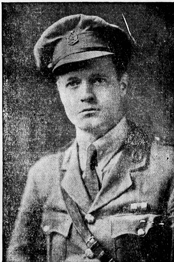
HON. DR. R. J. MANION, M. C. Leader National Government Party