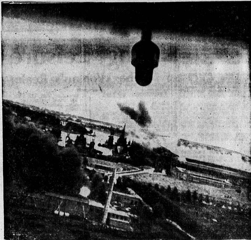
The above picture was taken from a Blenheim Bomber, similar to those which probably took part in last night's raids by the Royal Air Force. In this picture the planes were in a daylight attack on shipping in the harbor and on Nazi-operated factories. The bombers swooped as low as 60 feet over their targets to make sure there were no misses. Already fires can be seen springing up along the waterfront.