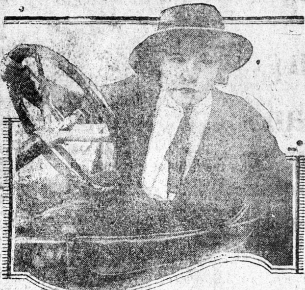
ETHEL CLAYTON "A Sporting Chance"