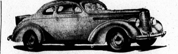
1938 DODGE DELUXE RUMBLE SEAT

Further contributing to riding comfort are a highly developed weight distribution and the successful synchronized action of specially long, semi-elastic springs fashioned of thinned-down specially arranged leaves of Amola steel