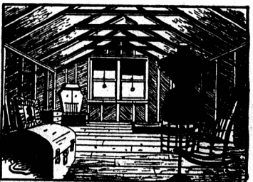
"Eyesore" attics and basements CAN make more living space. Your contractor or lumber dealer will gladly advise you about using Sylvaply Douglas Fir plywood to modernize your home.