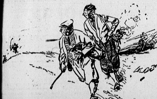
"Is that the new member?" "Yes; he's apparently just 'swearing himself in'."

The fifth game of the East Prince Rural Hockey League was played on the Tryon rink on Monday evening. The game was a very close one and was a credit to the players. The game was a very close one and was a credit to the players. The game was a very close one and was a credit to the players. The game was a very close one and was a credit to the players.