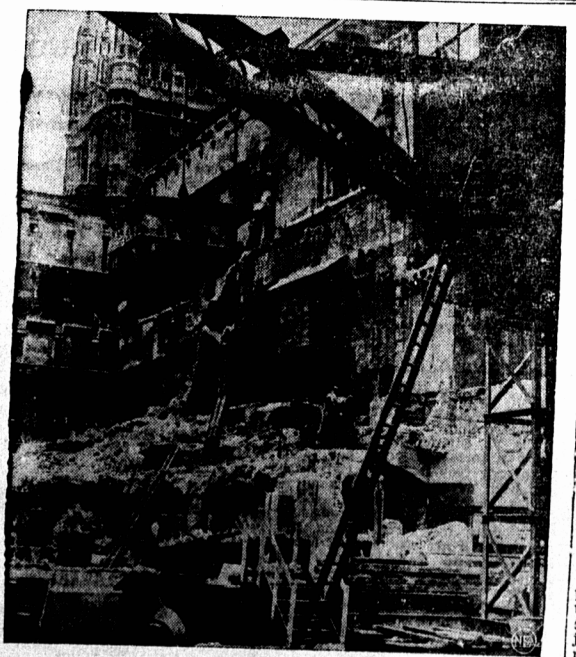
Along with a new government, Britain also is getting a new home for it. This is one of the first detailed pictures of wreckage caused by bomb hits on the House of Commons, May 10, 1941. It shows work on demolishing the wrecked building in preparation for complete reconstruction.