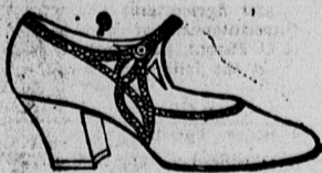
Our Number 3466 New Plaza Grey, with Shell Grey trim, covered heels.

For several days we have been opening and preparing our new Spring Shoes and Hosiery. We have a great surprise awaiting you. Our windows denote this to some extent. We will be delighted to help make a selection, and secure for you a perfect fit, (the supreme test of shoe merchandising.)