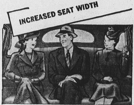
INCREASED SEAT WIDTH ● Seating width has been increased as much as seven inches. Ample room for three people to sit in comfort, front and rear. More leg-room, head-room. Extra wide doors.