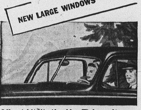
NEW LARGE WINDOWS ● New windshield is wide and deep. Windows are big, corner posts narrow. Nearly four square feet of glass has been added in Sedans. Smart new instrument panel and steering wheel.