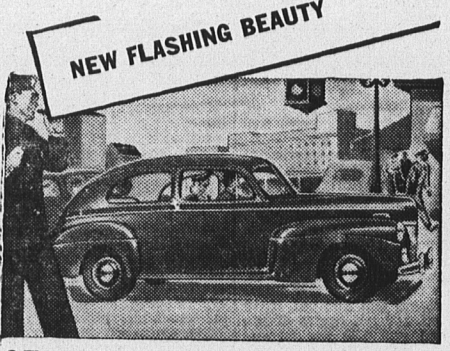
NEW FLASHING BEAUTY ● The new Ford is a great, racy, costly-looking car with larger, more massive body. Brighter, handsomer interior treatment and a new richness in fittings and upholstery.