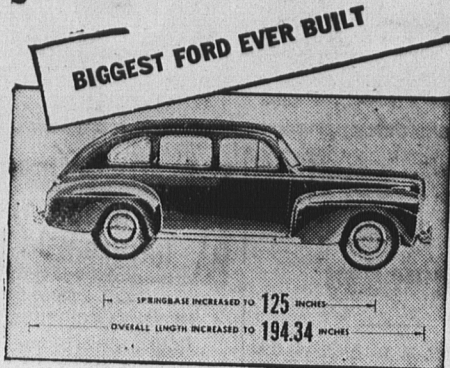
BIGGEST FORD EVER BUILT ● A new and larger Ford with a completely new and larger body. Wheelbase and springbase have been increased. Body extends over running-boards to give exceptional width.

Chile has voted an additional $5,000,000 to rebuild earthquake areas.