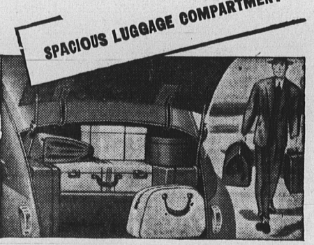
SPACIOUS LUGGAGE COMPARTMENT ● Space for several big bags and smaller pieces. Spare wheel mounted vertically. Compartment is lined, lighted.