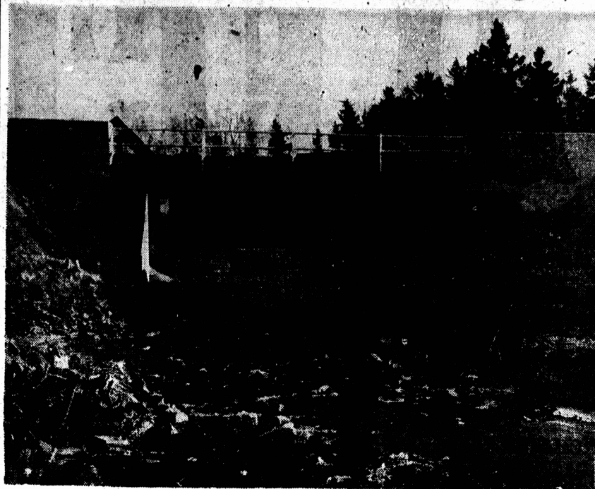
Above is the new steel bridge at Breadalbane looking towards the dam. Pictured below is the built of Canadian-made flat cars originally manufactured for Soviet Russia. The view is up stream.