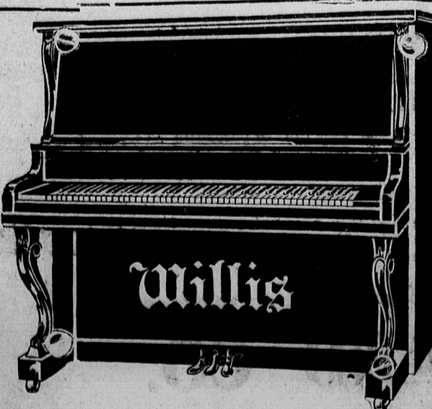
$500.00 Willis Piano, First Prize in District Number Three.

No coupon either "Clipped" or "Special" will be sold for money or other consideration, but shall be obtained only by being clipped from the Guardian, or being secured through the regular subscription channels.