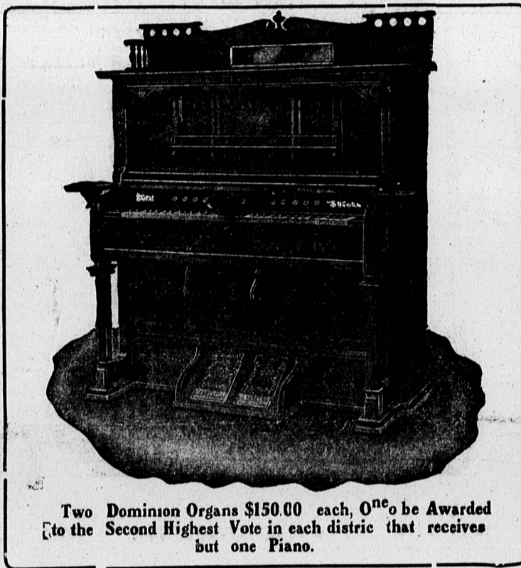
Two Dominion Organs $150.00 each, One to be Awarded to the Second Highest Vote in each district that receives but one Piano.

Address all communication relating to the contest, to CONTEST MANAGER, Charlottetown Guardian, Charlottetown, P. E. I.