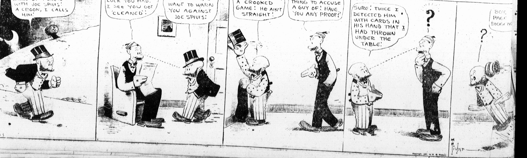
—By Bud Fisher