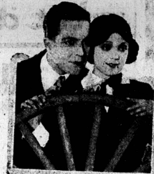
LILA LEE "The Cruise of the Make-Believes"

How a little Slum Girl aided shipbuilding. Newest of screen stars in Daintiest Film Presentation A strong supporting cast including Harrison Ford