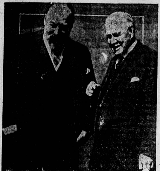
THEY'RE PROBABLY TALKING RADIO