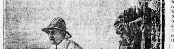
PHOTOGRAPH OF REGENT AND PREMIER OF GREECE TAKEN RECENTLY AT ATHENS