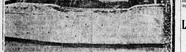
THE REGENT AND PREMIER OF GREECE TAKEN RECENTLY AT ATHENS