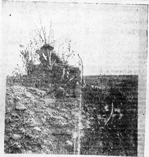
AN OBSERVATION POST

AMSTERDAM, Oct. 8.—Excited crowds filled the streets of Berlin yesterday evening looking for special editions of the newspaper containing the speech of Prince Maximilian, the New Chancellor, from the hands of the newsboy. Everywhere shouts were heard "Peace has come, Peace at last."