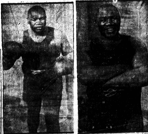
TWO PICTURES OF THE FAMOUS HEAVYWEIGHT AS HE LOOKS TODAY

The first pose is the one Sam employed when in the heyday of his career. The only difference is that he is much heavier now. The other pose shows the old Langford smile. This world wide known pugilist is accompanying the Lynch Shows which will be at the Exhibition Grounds during Fair Week.