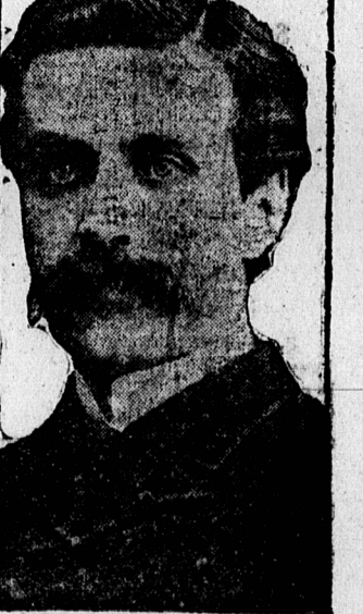
HON. L. P. PELLETIER.

(Canadian Press.) OTTAWA, May 21—"Entirely imaginative and without foundation. First I have heard of it." Premier Borden tonight gave the above emphatic reply to a story circulated industriously in Montreal and Ottawa today that Hon. L. P. Pelletier had tendered his resignation as post-