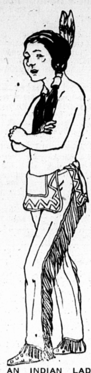
AN INDIAN LAD