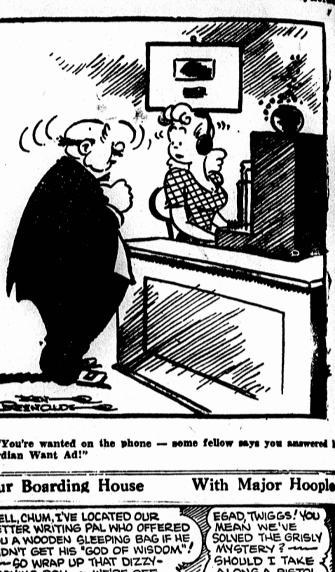
You're wanted on the phone - some fellow says you answered the Guardian Want Ad!