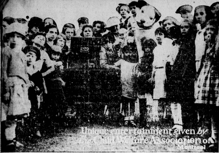
Children's entertainment given by the Child Welfare Association of Montreal.