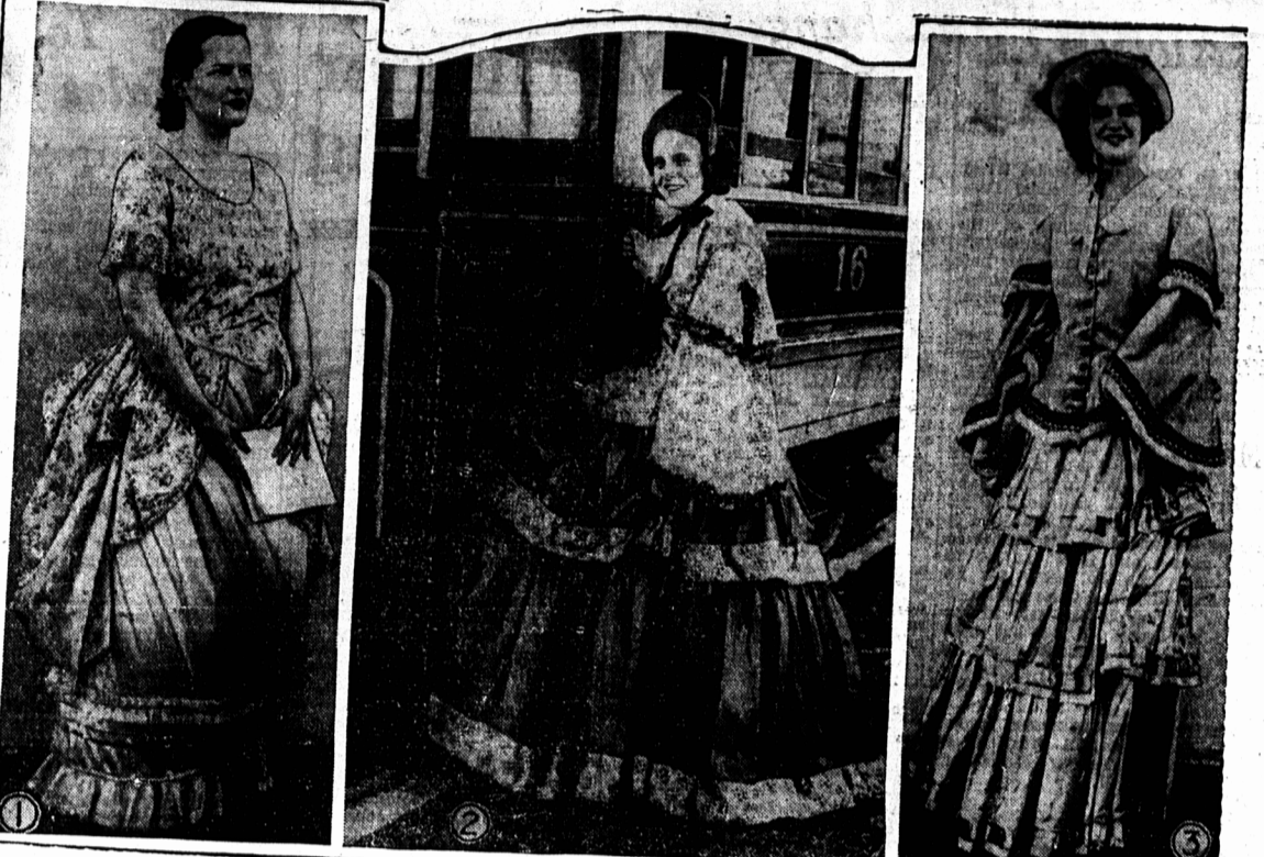
Time was sent rolling backward in its flight on Monday night July 2, when, with a blaze of pageantry, the history of Toronto and of its early settlers was portrayed with faithful authenticity on a specially constructed stage.