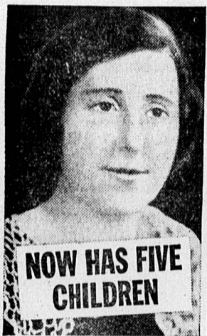
NOW HAS FIVE CHILDREN

It is better to see clearly one or two things in life than to move confused and blinded in the dust of an impotent activity.