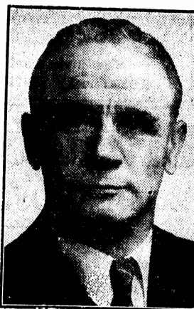
Hon. John Bracken