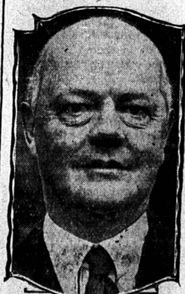
RT. HON. VISCOUNT HALIFAX Secretary of State for War in the British Cabinet and former Attorney General.