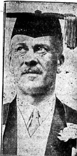
LORD BESSBOROUGH Governor General of Canada who will make the formal opening speech of welcome to the delegates.