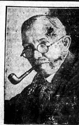
RT. HON. J. H. THOMAS Secretary of State for Dominion Affairs.