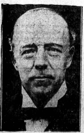
RT. HON. WALTER RUNCIMAN President of the British Board of Trade and a well known writer.