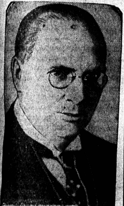
PREMIER R. B. BENNETT who will likely be chosen as chairman of the conference.

(Special to The Guardian) The Acadia settlement of Egmont Bay, which is the oldest French settlement on the Island, today, dating back to 1758 was honoured by being chosen for the first congress of the Acadians ever to be held on the Island, when Acadians from all parts of the province met in happy reunion and which was held yesterday with glorious weather. It was also the occasion of the first local convention of the Society L'Assomption. Delegates were present from the different branches in the province and representatives from the La Societe Nouvelle to Tignish, Miscouche and St. Louis. On Tuesday evening, the business meeting of the convention of the Society L'Assomption was held in Egmont Bay Hall, when business matters were discussed and the officers for the next term elected. Rustico was chosen for next year's convention and Hope River for the holding of the congress. Yesterday.