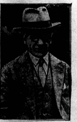
SEAN T. O'KELLY Head of the Free State delegation and Vice President of the Executive Council.