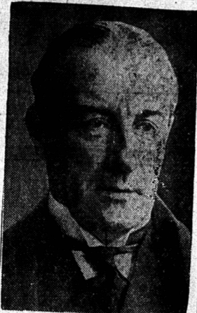
RT. HON. STANLEY BALDWIN Lord President of the Council and leader of the British delegation.