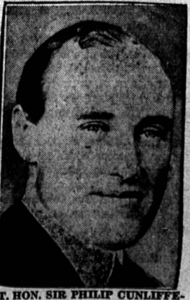
RT. HON. SIR PHILIP CUNLIFFE-LISTER Secretary of State for the colonies and former Board of Trade President.