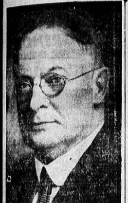
TO HEAD LABOR BOARD

WOOD ISLANDS FERRY (DAILY, INCLUDING SUNDAYS) Leave Wood Island 6:00 A.M., 10:00 A.M., and 2:00 P.M. Leave Caribou 8:00 A.M., 12 noon and 4:00 P.M.