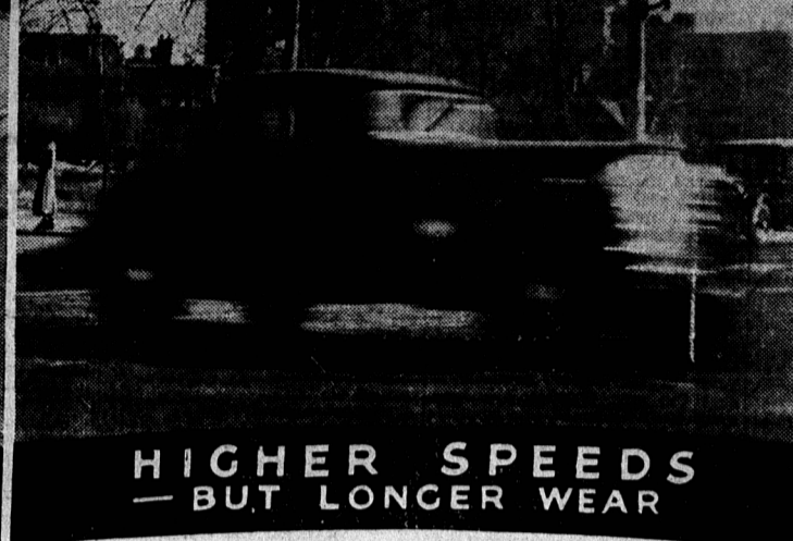
HIGHER SPEEDS — BUT LONGER WEAR