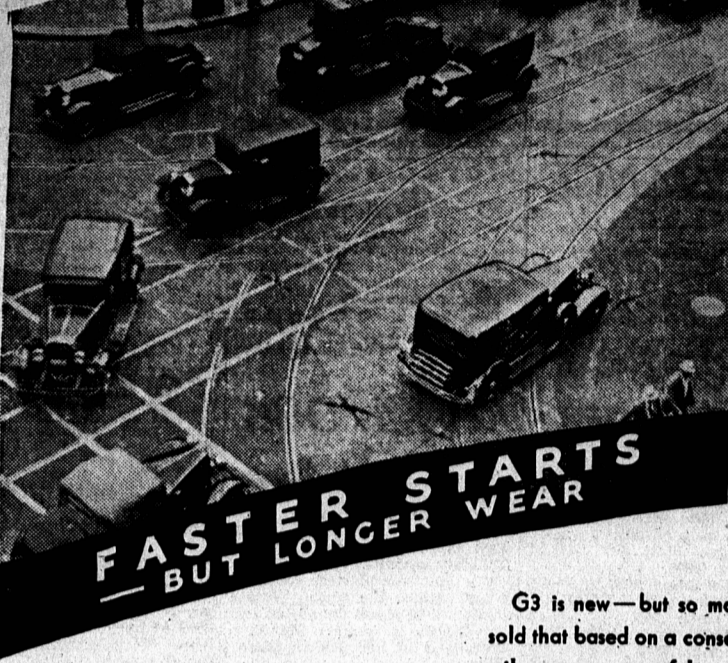
FASTER STARTS — BUT LONGER WEAR