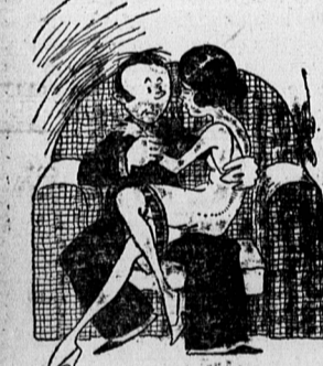
He: Ma looks on me as a hero. She: That may be, but it strikes me zero would be better.