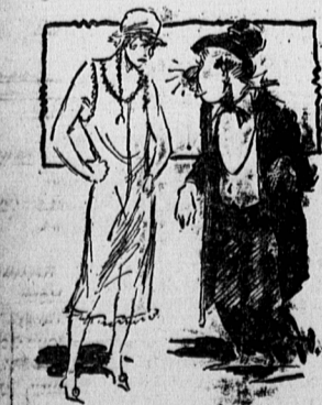
NOT TO BLAME "What do you mean by coming home here half drunk?" "That's my fault dear. My money ran out."