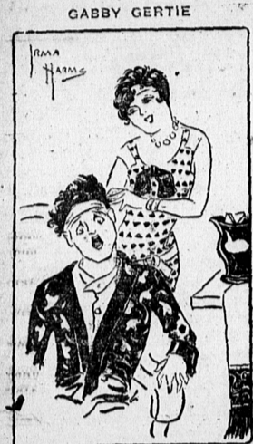
"Cold water is the most effective remedy for fire in the lumber region."