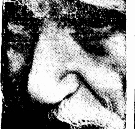
GEORGE BERNARD SHAW