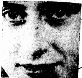
PRINCESS MARGARET ROSE