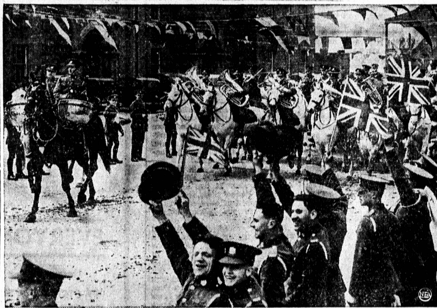
Best tragedy mar the glorious day of the crowning of King George VI and Queen Elizabeth by some charger bolting in fright into the throngs lining London streets, 400 horses of the Royal Scots Greys are being "conditioned" to the noise, confusion, and bustle which can be expected. At Aldershot, troops equipped with flags line the barracks square to cheer and wave while the cavalry, band ahead, marches past.